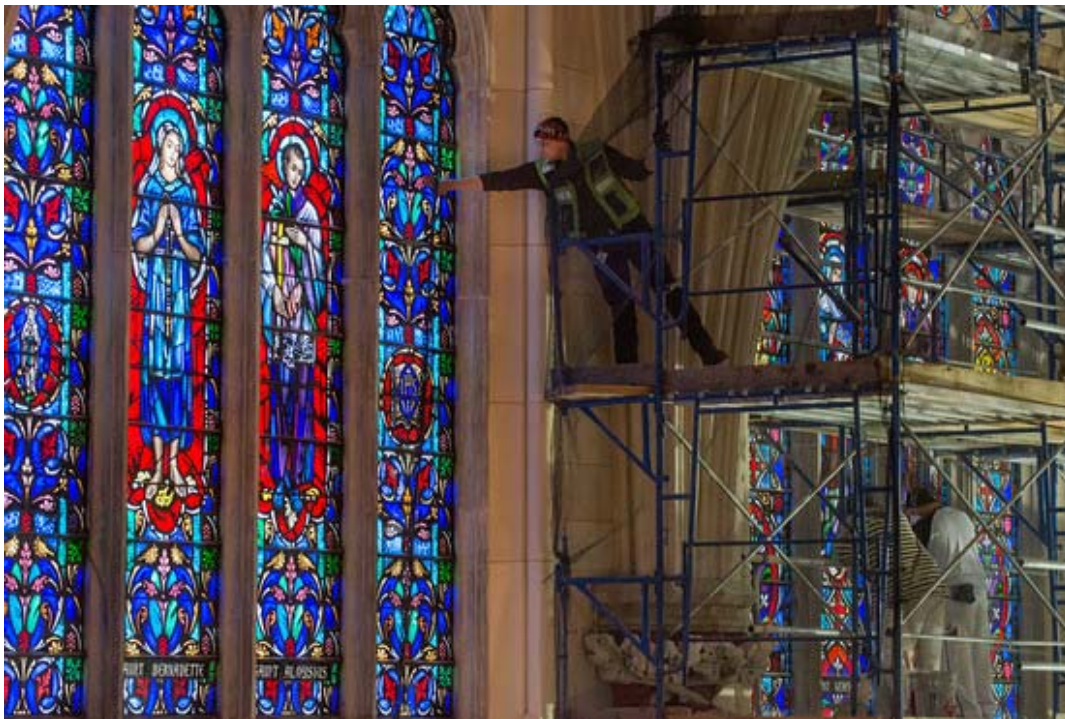
A worker reaches to fix a detail on a stained glass window as restoration work continues.

Photographer Craig Warga documented the activity on Tuesday.